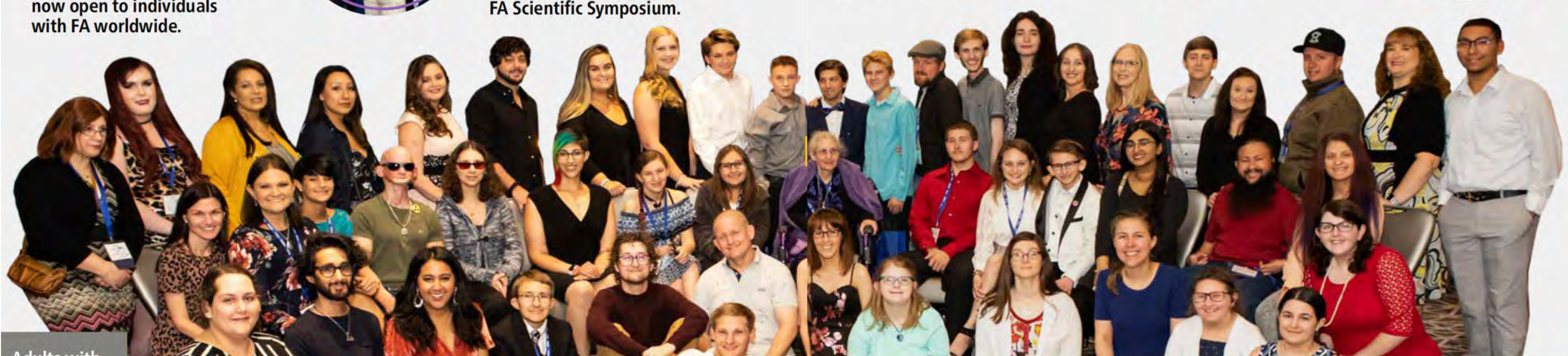
Adults with FA at their annual meeting (Chicago, 2019)